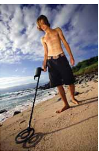
The kingdom of God is like a man who found hidden treasure and then sold everything he had to make it his own

Ask yourself if those things really appeal to you. Do you want to live for ever in a world whose inhabitants are at peace with God? Do you want a life where violence, cheating, selfishness, ruthless competition and exploitation