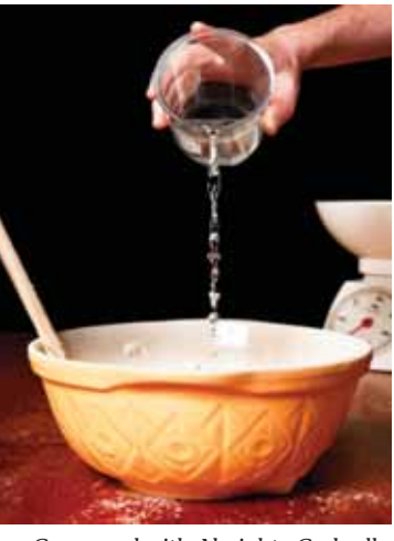
Compared with Almighty God, all nations are like a bit of flour left on the scales after you've made a cake

Not that the world itself is due to end, whatever scientists may predict. There is a set of data that far surpasses human calculation or human prediction. The God of the Universe has revealed His purpose and, as Maker and Creator, He should know if anyone does. So what does He say?